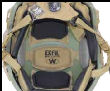
TEAM WENDY PAD SYSTEM