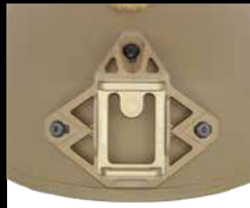
WILCOX® INTEGRATED SHROUD