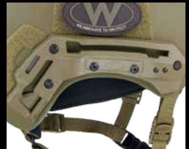
ACCESSORY RAIL 2.0